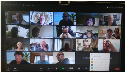
It wasn't always Zoom meetings like this.