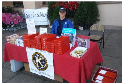
Sold See's Candy to raise money.