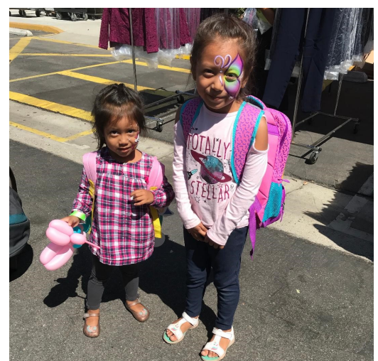
Provided 48 backpacks to kids through a program with South County Outreach.