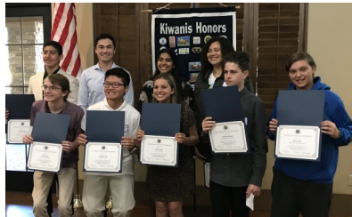
We recognized student achievers.