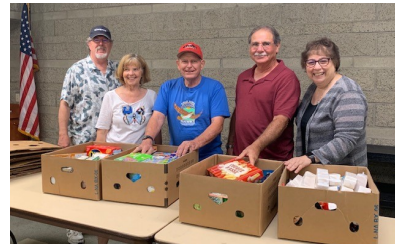
Distributed food to needy seniors.

This club year also marked creation of our first website