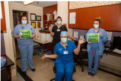
Lunch (see certificate at right) and masks (below) provided for workers at Mission Hospital.