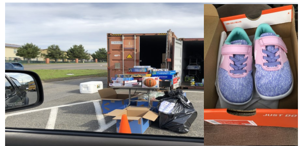
Gave toys and clothes to Camp Pendleton families.