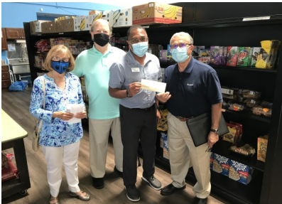
Food grant to South County Outreach.

This club year also marked creation of our first website